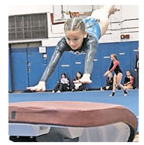
Come and support RVC UNITED and RVC ULTIMATE Gymnastic teams at the Recreation Center.

DETAILED INFORMATION FOR ALL ACTIVITIES CAN BE FOUND AT THE RECREATION CENTER OFFICE OR ON THE RECREATION CENTER WEBSITE AT WWW.RVCREC.WEEBLY.COM