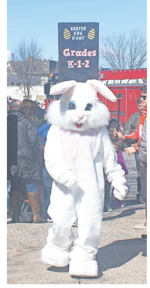
Join the Easter Bunny as he hops down the bunny trail at the Recreation Center on Saturday March 24 at 10:00am

Registration is now being accepted for residents and non-residents.