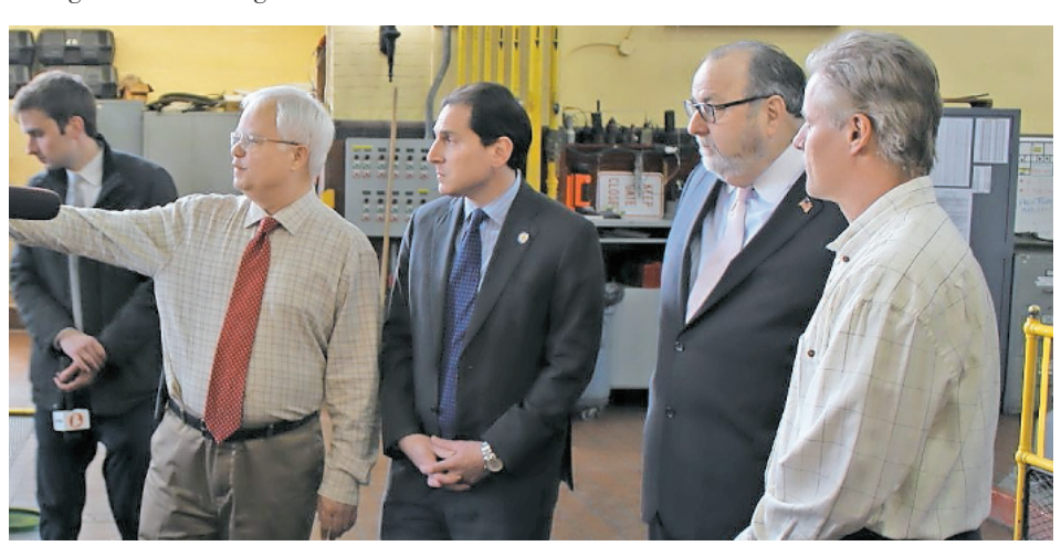
From the Office of Senator Kaminsky

future," continued Mayor Murray. "I would also like to thank Senator Todd Kaminsky and Assemblyman Brian Curran for their continued support on our journey with this incredible opportunity to enhance our generating facility in Rockville Centre."