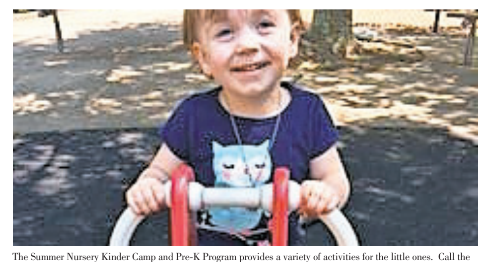
Recreation Center today to sign up for your favorite activity.

*DO NOT DISCARD USED NEEDLES IN HOUSEHOLD REFUSE