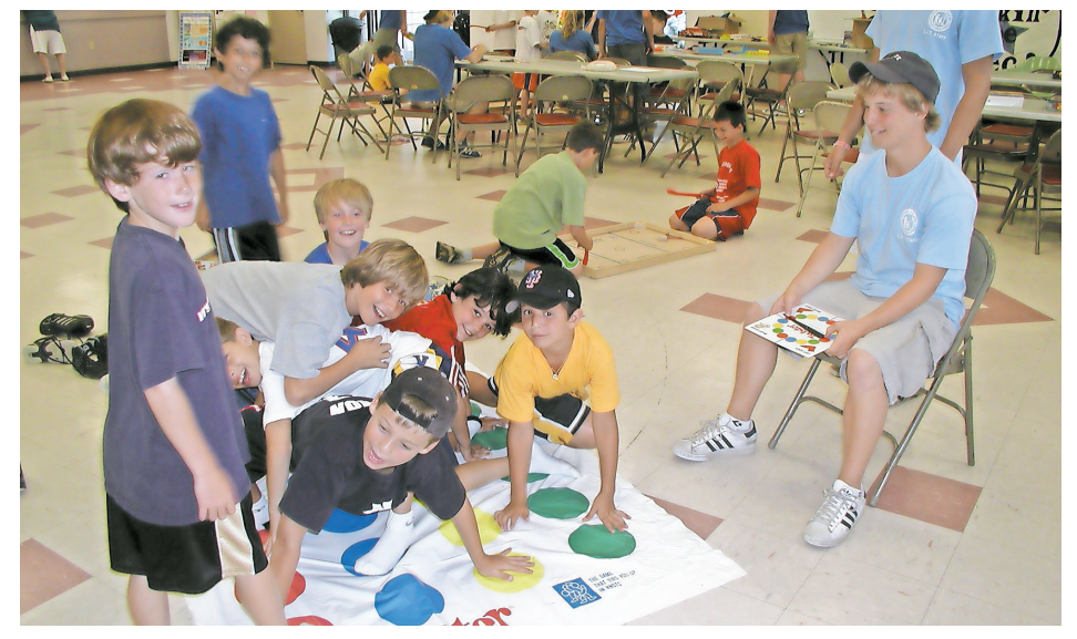
Celebrating its 63rd summer, the Summer Playground Program provides a day a fun for grades one through seven.