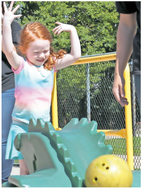
Bowling is one of the fun activities at the annual Kids'Fest on September 16th.

Check our website or the office for permission slip and fee schedule. These trips are open for all children, not only those who participated in the Summer Program.